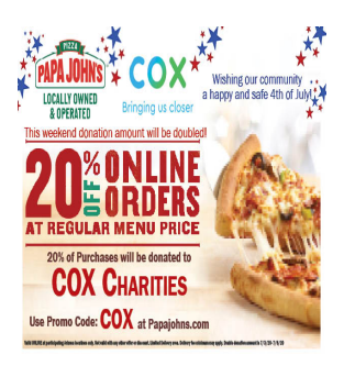
Use this coupon for Papa John's orders this weekend and 20%